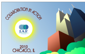
IAF North America Conference Week April 20-23